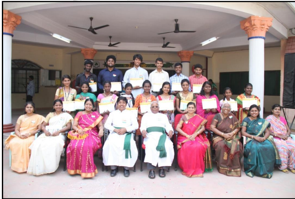
Republic day participants along with Director, Principal, Vice Principal, PCEC head and Republic day coordinators